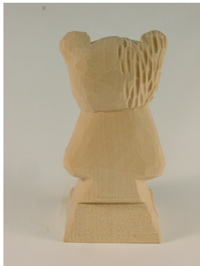
Bear 16 Back of head textured with small u-gouge (1/8" or less)