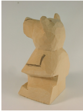
Bear 12 Dig out bottom of arm