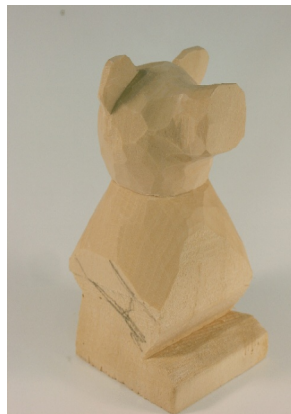
Bear 9 Start on arms and rounding body