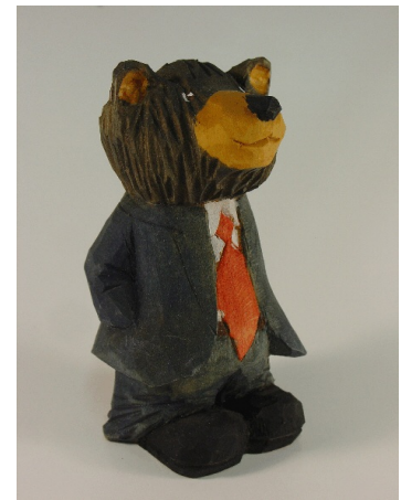
Well Dressed Bear