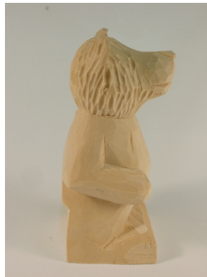
Bear 17 Finish texturing and round feet/shoes