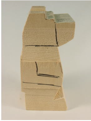
Bear 1 Side view of block