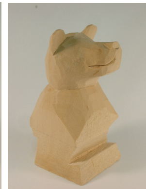
Bear 11 Mouth and nose outlined