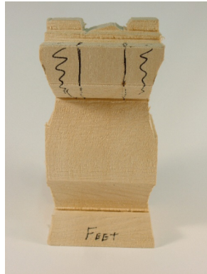
Bear 2 Front view of block