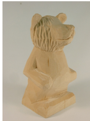
Bear 18 Do not texture the snout.