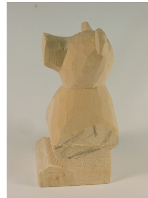
Bear 10 Side view of arm started and body rounded