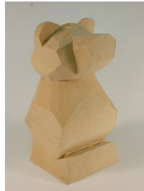
Bear 6 Show snout and ears defined as well as neck outlined