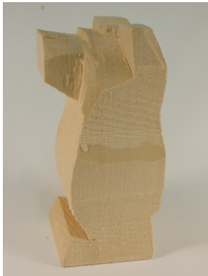
Bear 5 Side view of snout and ear started Make sure snout is very defined