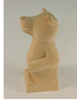
Bear 15 Side view of finished arm and head