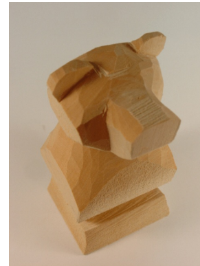
Bear 20 To view of snout started