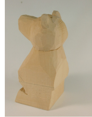
Bear 7 Show back of head outlined and snout/ears defined