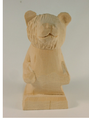
Bear 14 Completed arms and textured head