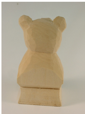
Bear 8 Back view of head with neck outlined