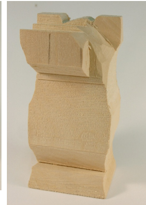
Bear 4 Start with getting snout carved and ear started