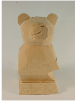
Bear 13 Arm started and mouth shown