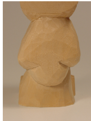
Pumpkin 9 Back view of Butt and rounding of pants