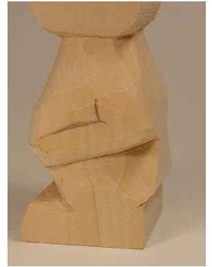
Pumpkin 5 Start with carving out arm