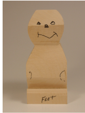
Pumpkin 4 Front View of cut out block