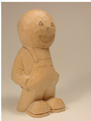
Pumpkin 11 Round head, draw face you want Shown with coveralls