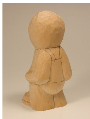
Pumpkin 12 Back view of rounded head. Put in lines for pumpkin segments