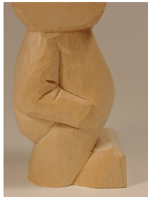
Pumpkin 8 Side view of finished arm, start of butt and pant leg/shoe