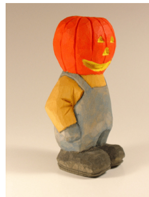
Pumpkin 14 Another version