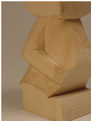
Pumpkin 6 Carve out top of arm to shape whole arm