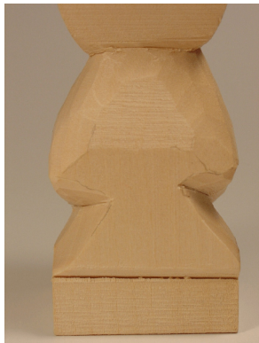
Pumpkin 7 Back view with both arm carved out