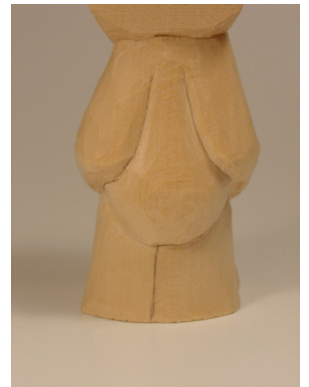
Pumpkin 10 Back view with finished arms and start of dividing legs