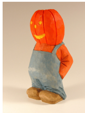
Pumpkin 13 My version of finished man. Put on any face you want.