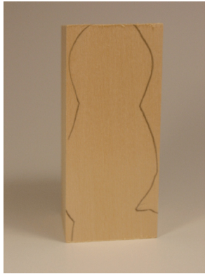
Pumpkin 2 Side view of block