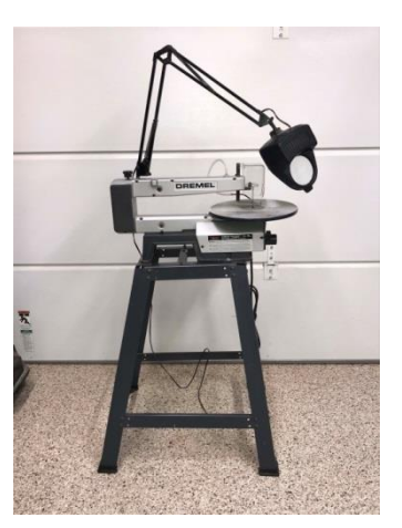
DREMEL 16" Scroll Saw with Base and Magnifier Light (Used, Very Good Condition)