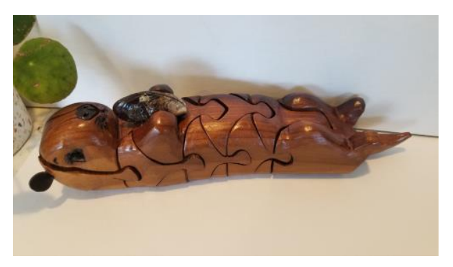
Mouse Factory Original Carving by Gwen Hadland -- Otter Puzzle

Please visit the auction: https://capitolwoodcarvers.org/auction.php